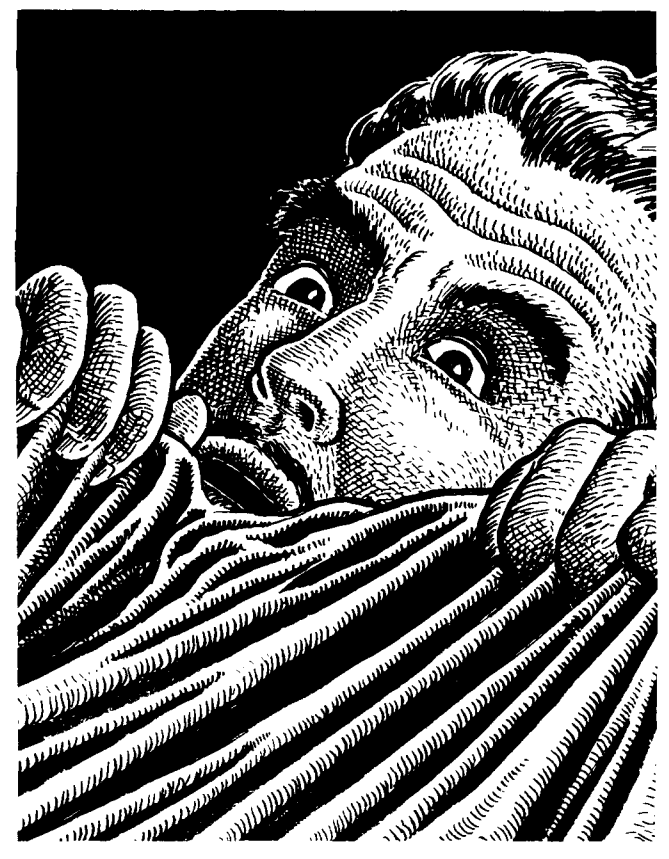
Boaz awakened after midnight to feel something pressing against his feet!