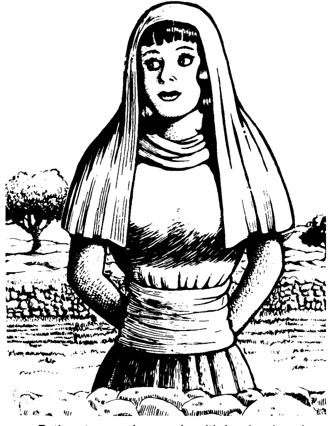
Ruth set a good example with her hard work.

Ruth set a good example that we can all follow: work hard with all your might and you will be blessed. Ruth was given a raise by Boaz. She didn't know it, but the extra grain or corn was a bonus for her hard work.