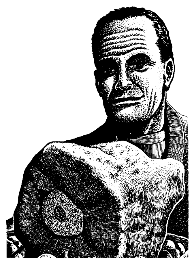
Saul was placed at the head of the table as God's newly appointed king of Israel.

received God's Spirit, Samuel called all of the people together. When lots were cast for all the people, Saul's name was taken. This was God's way of showing Israel whom He had chosen as king.