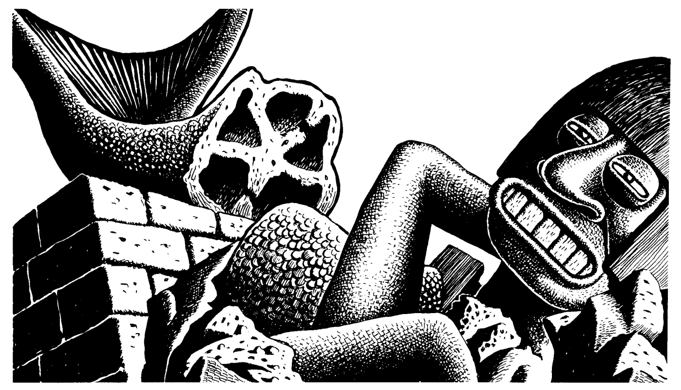
The Priests of the temple of Dagon were shocked to find their idol had fallen toward the ark, and the arms and head were broken off.